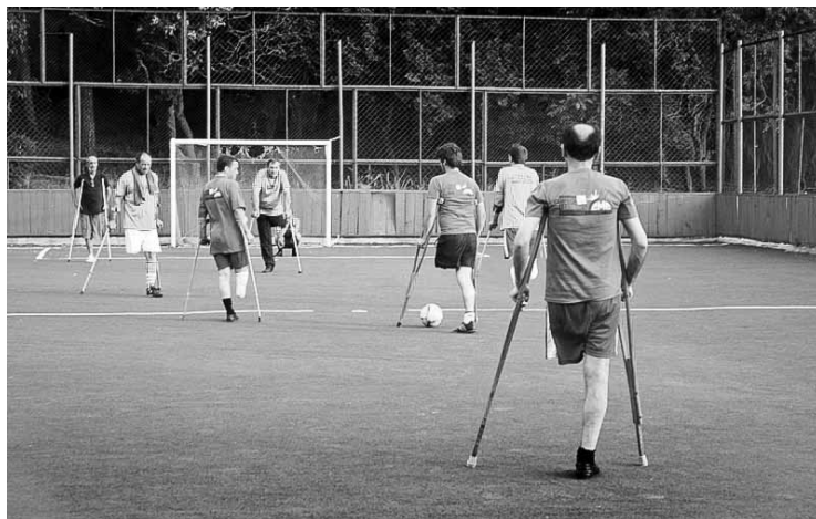
A soccer match celebrates the first anniversary of the entry into force of the Convention on Cluster Munitions in Georgia.

operative, pending the passage of a decree to enforce it. 48