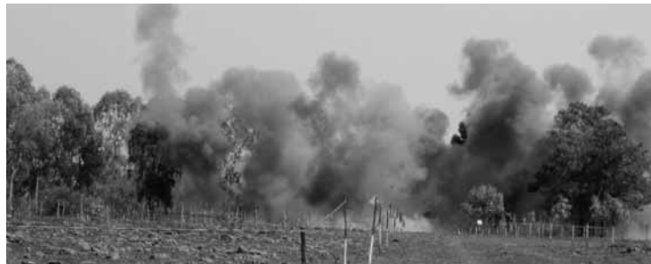
A clearance team explodes unexploded submunitions in Lao PDR.