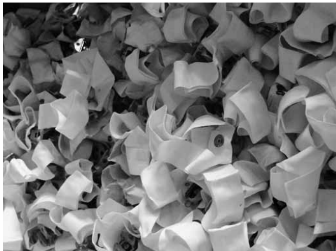
© Alma Tassitani/HH, 8 October 2010

The convention's Second Meeting of States Parties on 12–16 September 2011 was held in Lebanon, another highly contaminated country.