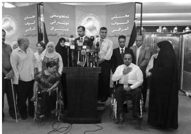
Iraqi campaigners discuss disability rights issues with the media after a meeting with the Iraqi parliament's Human Rights Committee.

Under Article 7 of the convention, States Parties are required to submit reports on the status and progress of implementation of all victim assistance. Victim assistance reporting under the convention is obligatory unlike the Mine Ban Treaty's voluntary reporting on victim assistance.