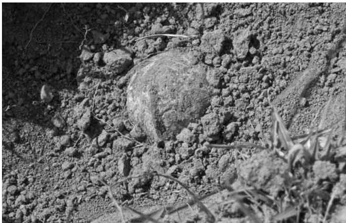
A buried cluster submunition in Lao PDR.