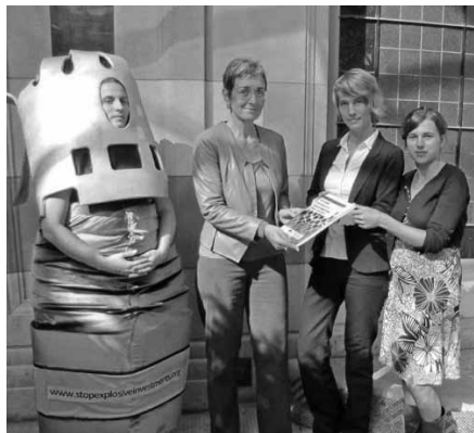
Campaigners and parliamentarians participate in the launch of a report on disinvestment in cluster munitions in Belgium.