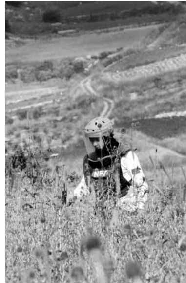
A deminer searches for unexploded submunitions in Lebanon.