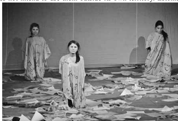
An event in Georgia commemorates the lives lost to conflict.

A total of 34 states have developed or produced 44 more than 200 types of cluster munitions. 45