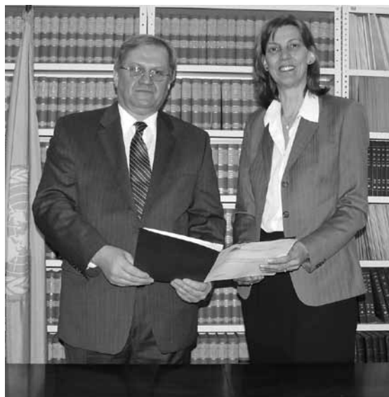
Bulgaria ratifies the Convention on Cluster Munitions at the UN in New York.

Only one country that has not joined the convention, the US, has disclosed the size of its stockpile of cluster munitions. As reported to its legislature in 2004, the US stockpile consisted of nearly 5.5 million cluster munitions containing nearly 730 million submunitions.