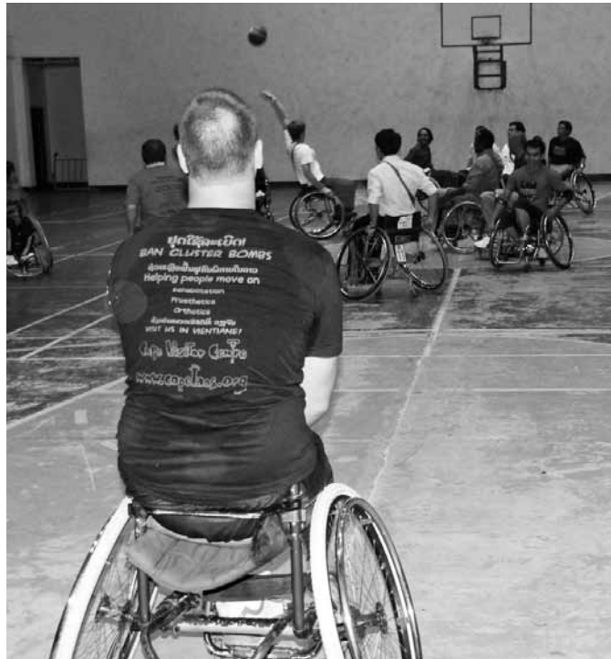
Wheelchair basketball game at the IMSP in Lao PDR.

Almost all known cluster munition casualties were civilians, the majority male, and a significant proportion were children at the time of the incident. 11