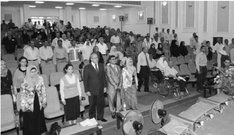
Campaigners in Iraq celebrate the first anniversary of the entry into force of the Convention on Cluster Munitions.

In 2010, 11 states and the EC reported contributions toward cluster munition-related activities valued at US$20.52 million. Eight of the donors are States Parties to the Convention on Cluster Munitions and the other three states had signed, but not ratified, as of 25 August 2011. Contributions from both Norway and the EC made up more than half (56%) of the total funding contributions.