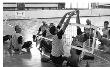
A sitting volleyball match with players from Croatia and Serbia celebrates the first anniversary of the entry into force of the Convention on Cluster Munitions.

Lebanon and Lao PDR received 72% of all reported cluster munition-specific donor contributions. More than half (58%) of the contributions for Lao PDR in 2010 were made via the Cluster Munitions Trust Fund for Lao PDR. 7