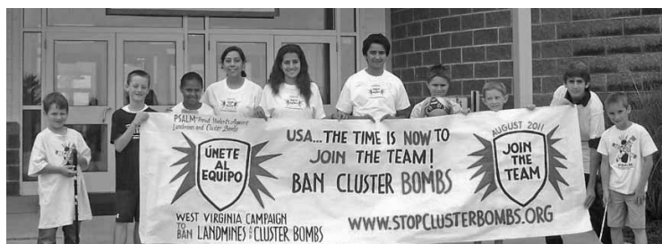
US youth campaign against cluster munitions.

18 July 2011