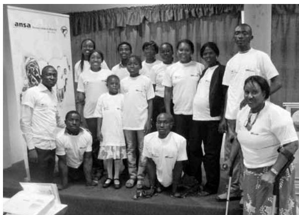
A workshop in Nigeria to mark the International Day of Persons with Disabilities.

© Nkem Menkiti/IANSA Women's Network, 3 December 2010