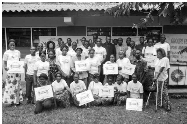
Campaigners in the DR Congo celebrate the first anniversary of the entry into force of the Convention on Cluster Munitions.

The convention requires detailed annual reporting on past and planned use of retained cluster munitions to ensure they are being kept only for permitted purposes. Three States Parties have reported using (i.e., consuming, destroying) cluster munitions and explosive submunitions during the period covered by their initial transparency reports. Belgium used 24 retained M483 projectiles (containing 2,112 submunitions) for explosive ordnance disposal (EOD) training and apparently intends to use 25 projectiles a year for training. The UK destroyed 12 M42 submunitions (eight in a student project and four on a “defeat of armour” demonstration), while Germany destroyed 10 cluster munitions containing 958 submunitions during EOD training.