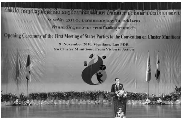
Opening of the IMSP in Lao PDR.