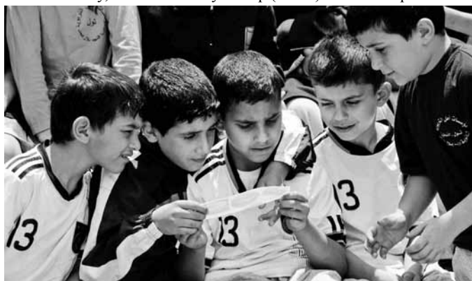
Students review a safety booklet during a risk education workshop in Lebanon.