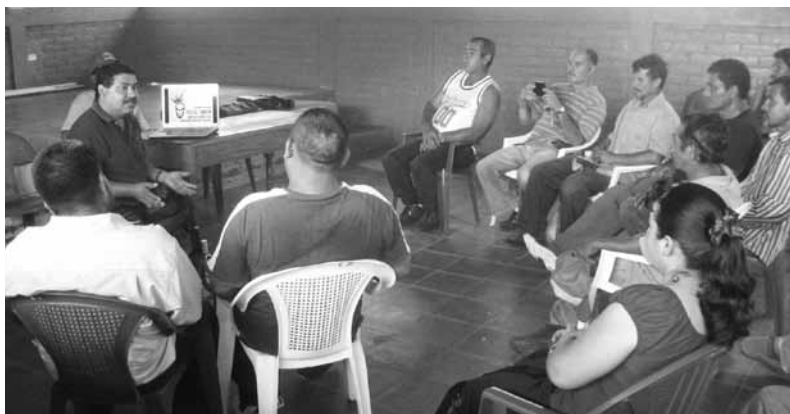
21 July 2010

NGOs and national stakeholders have continued to raise awareness with governments and investors on the question of cluster munition financing, including through the Stop Explosive Investments campaign initiative launched by the CMC in 2009. 134 On 25 May 2011, campaigners in 14 countries took part in a Global Day of Action on Disinvestment including IKV Pax Christi and Netwerk Vlaanderen who issued an update of their October 2009 report, Worldwide investments in cluster munitions: a shared responsibility . 135 According to the updated report, a total of 166 financial institutions have invested $39 billion in eight producers of cluster munitions since the May 2008 adoption of the Convention on Cluster Munitions. 136