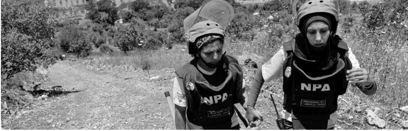
▲ Deminers head to work in Lebanon.