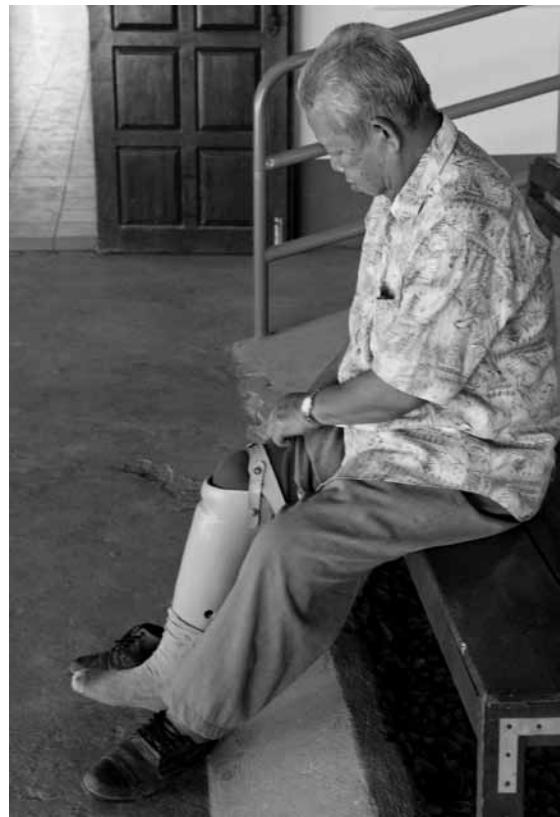
© Moadfik Alkhatib/ITADO, 19 June 2011