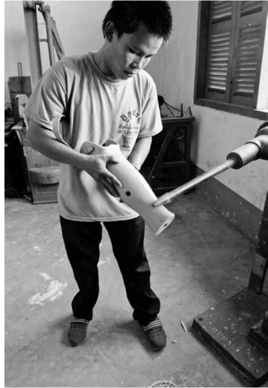
A technician manufactures a prosthetic leg in Lao PDR.