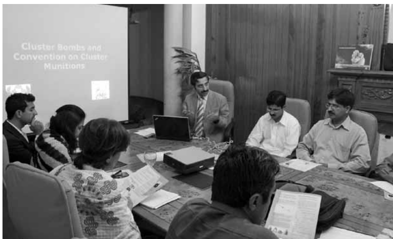
Workshop on the Convention on Cluster Munitions in Pakistan.

Article 21(2) of the Convention on Cluster Munitions requires that each State Party “make its best efforts to discourage States not party...from using cluster munitions.” A significant number of States Parties and signatories condemned or expressed grave concern about the use of cluster munitions by Libya and Thailand and the incidents attracted widespread media coverage and public outcry. 41 The CMC has welcomed these statements and noted in June 2011, “It is only through widespread and vociferous criticism that a deep stigma will attach to the use of cluster munitions, and that stigma is our most powerful method of ensuring a world free of these weapons.” 42