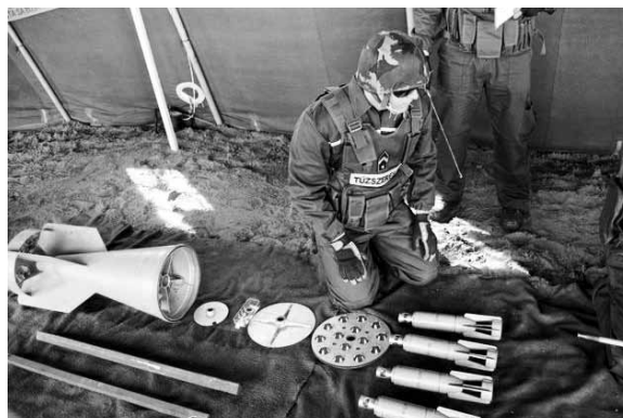
24 March 2011

As of 15 August 2011, the Czech Republic and Italy had completed their domestic ratification procedures, but had not yet deposited their instruments of ratification with the UN.