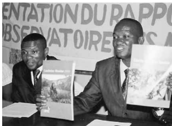
Monitor report launch in the DR Congo.

The CMC has called for states to end their deliberations on cluster munitions at the CCW's Fourth Review Conference in November 2011, regardless of whether an agreement on cluster munitions is reached. To achieve some positive results from the past four years of work on cluster munitions, the CMC has promoted the “optimal outcome” of a humanitarian-inspired political declaration and national measures taken as interim steps towards acceding to the Convention on Cluster Munitions. 38