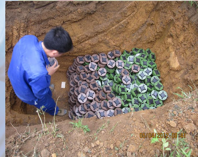
© Sr Col Tuan, April 2012

59 States and 6 other areas landmine affected